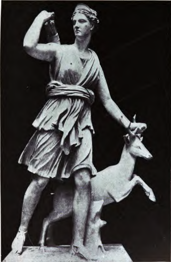
Fig. 20. Artemis of Versailles.